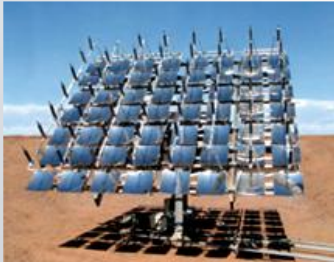
Figure 4. One of the most efficient PV panels in the world — this dual-axis PV tracking system uses small mirrors to focus sunlight on high-efficient cells. It supplies electricity to the Arizona Public Service grid.

It might not be obvious at first, but look closely at the bases supporting the panels. They are designed to move! SunPower Corporation, a German