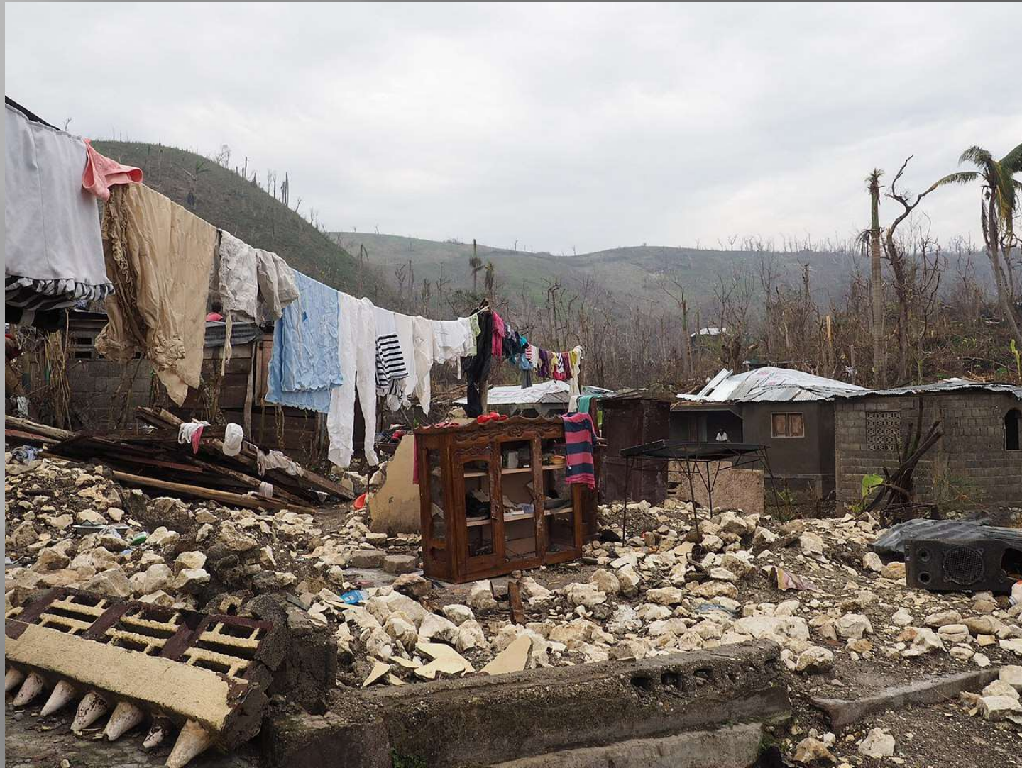
Damage to a house in Haiti after Hurricane Matthew