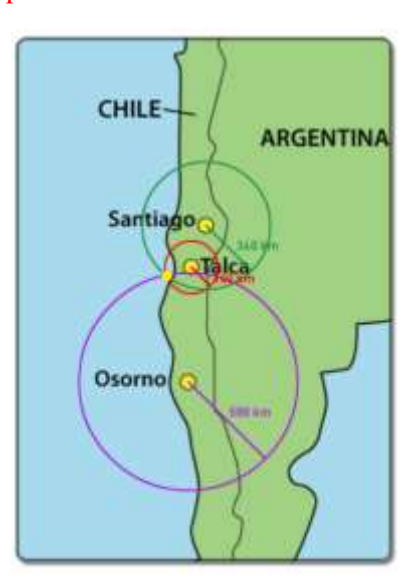
Circles were drawn using the epicenter distances for each location.