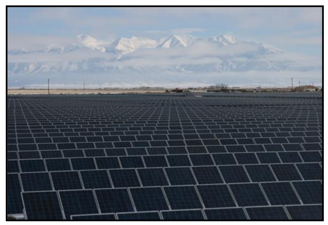
This field of PV panels in Alamosa, CO, is one of the largest PV power plants in the US.

In this experiment, you will measure voltage and current in order to determine the power output of a photovoltaic (PV) panel. You will vary the resistance in a simple circuit connected to the panel to demonstrate the effects on voltage, current, and power output. Then, you will calculate power for each resistance setting, creating a graph of current vs. voltage, and indentifying the maximum power point.