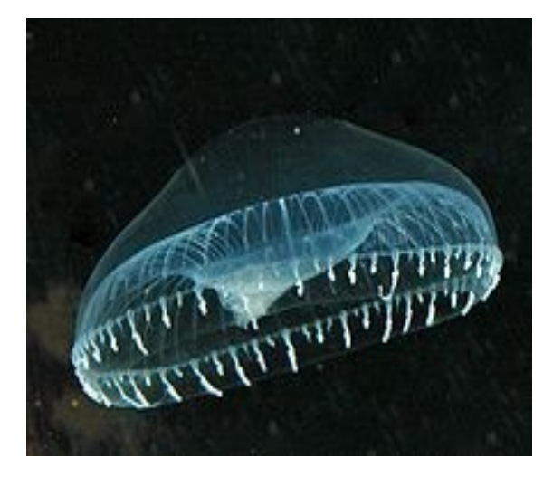
Crystal Jelly Bioluminescence