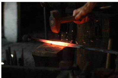
Heat transfer in the rod