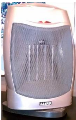
Heat transfer through the air

Label each picture with the type of heat transfer that is occurring: