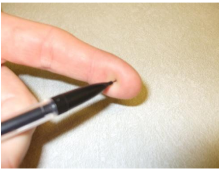
Procedure step 2.