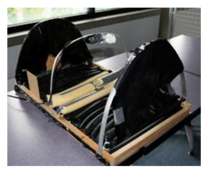
Figure 6. Completed (and uncovered) synthetic abdominal cavity simulator with "hill."

Image sources: Figures 1, 2, 4, 5, 6: Brandi N. Briggs Figure 3: Benjamin S. Terry ITL Program, College of Engineering University of Colorado Boulder