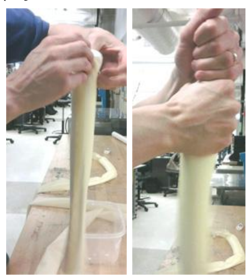
Figure 2. Use your hands to push and knead the silly putty mixture into the latex tubes.

Fill the latex tubes (or bicycle tubes) with the silly putty mixture, piece-by-piece (Figure 2-left), and knead the putty into the latex (or bicycle) tube (Figure 2-right) until the entire tube is filled. Make sure that air gaps do not form or remain in the tube. Close one of the open end of a tube with a zip tie, make sure that the entire tube is filled with silly putty and then close the other open end of the tube with another zip tie. Optional for latex tubing: Line the seam of the tube with duct tape to prevent students from opening this seam with their devices.