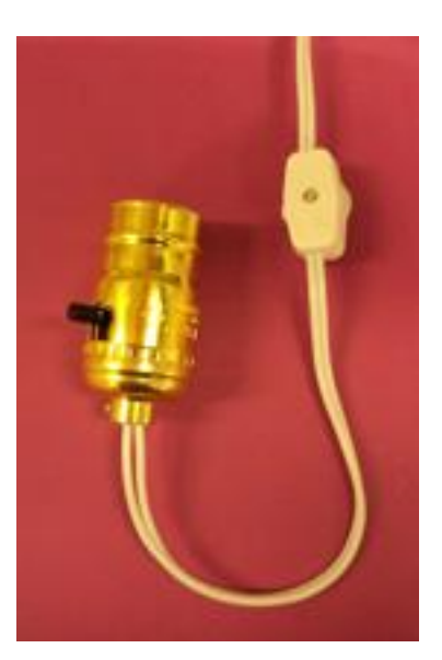
Figure 4. Standard light bulb socket with an attached wire and on/off switch.

Finally, cut two semi-circle shaped flaps from a black plastic garbage bag and attach one to each of the end ribs (see Figure 5); this flap conceals the interior of the abdomen during testing. Optional: Cut small rectangles of hardboard (approximately 3.5 x 4.5-in) and hot glue to the inner edge of the rectangular base of the abdomen. Drill one screw halfway into the top of each rectangle. This can be another surface on which to stick Playdoh if you do not want all of the endometriosis locations to be on the abdomen floor. Playdoh on these boards are typically easier to biopsy as well (see Figure 5).