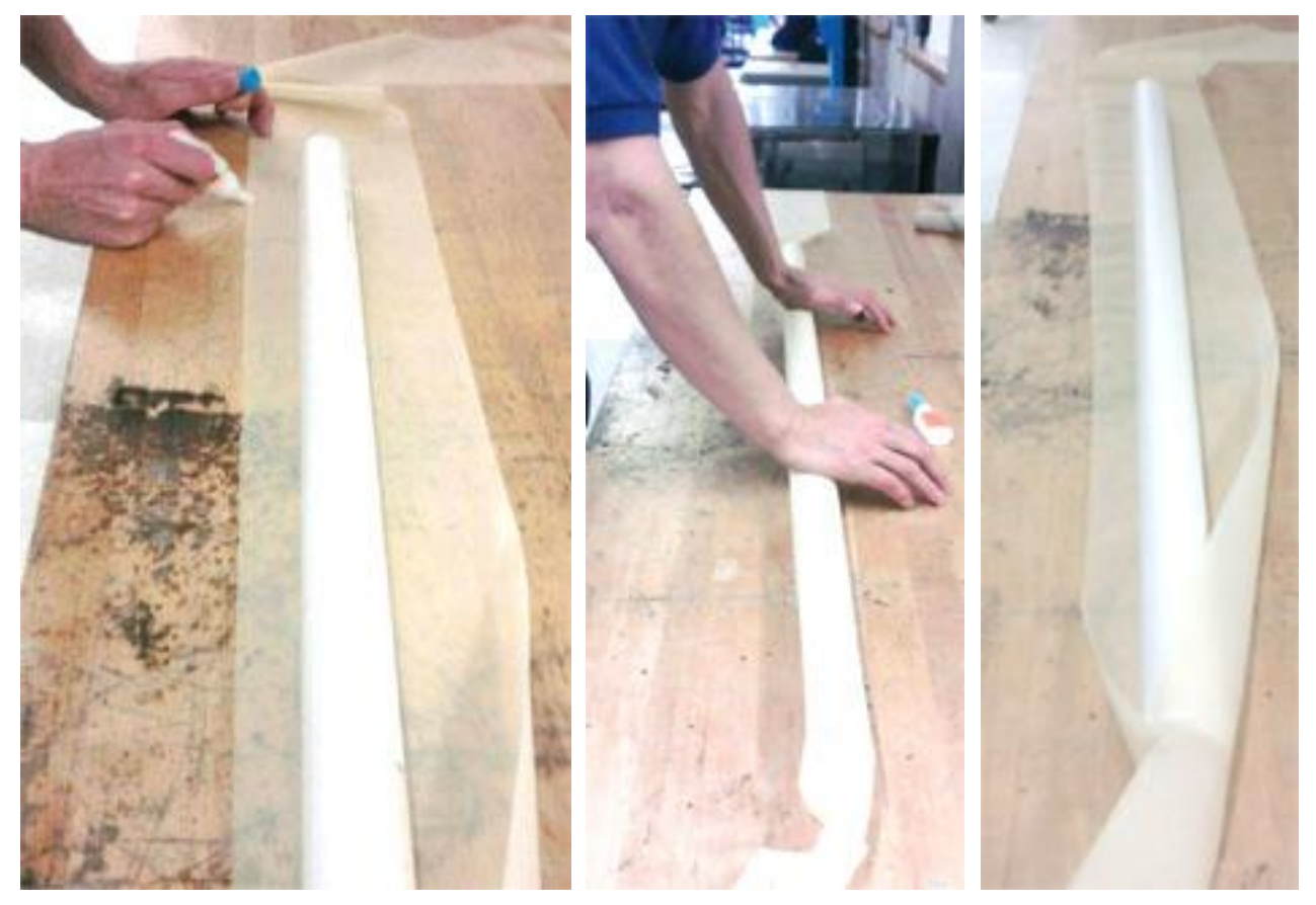
Figure 1. (left) Apply adhesive to latex sheet edge. (middle) Wrap sheet around 1.5 to 2-inch diameter PVC pipe to adhere latex sheet edges. (right) Remove PVC pipe from the sealed latex tube and continue adhering edges of latex sheet.

Lay a portion of the 10-yard, 0.02-in thick, 6-in wide latex rubber sheet lengthwise on a long table; drape the remaining sheet off the table and onto the floor. Squirt a continuous bead of super glue along one edge of the latex. Place a 1.5-in to 2 -in PVC pipe lengthwise on top of the latex sheet (Figure 1-left). Adhere opposing edges of the latex by loosely wrapping the pipe with the latex and overlapping the opposing edges. Use the pipe to apply uniform pressure to the newly adhered seam. Apply pressure along the seam with the pipe for about 30 seconds (Figure 1-middle). Wait 5 minutes for the seam to fully cure, then remove the pipe. Repeat the procedure for the entire length of the latex sheet (Figure 1-right). Cut the tubing into shorter sections for easier filling, with lengths varying between 1 to 4 ft. Varied lengths create a more realistic environment of rough terrain in the abdomen.