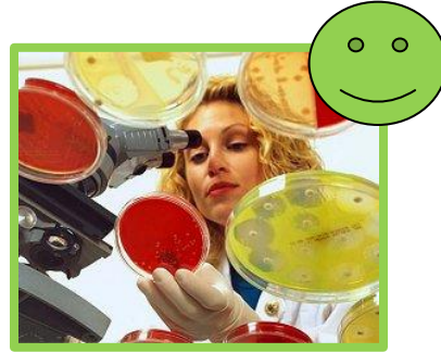
Figure 4. Example GOOD image of a female engineer working with cells (for the Cells unit).