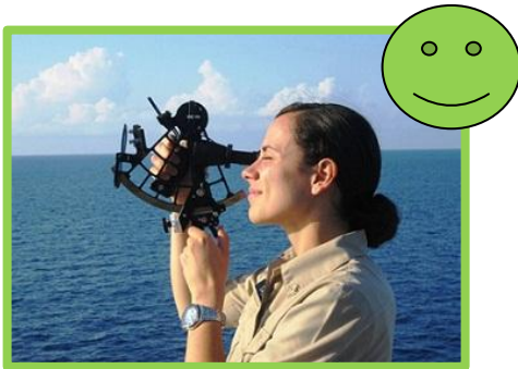
Figure 5. Example GOOD image of a female engineer (using a sextant).

In addition to looking for engineering images showing people who are engineers, also look for images of engineering inventions being used by women or diverse populations . Figures 5 and 6 illustrate other good images of females doing or using engineering.