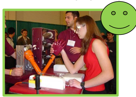
Figure 8. Example better image illustrating a “strong arm” with a female in the picture.