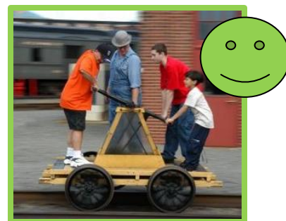
Figure 8. Example better image for the Simple Machines unit illustrating a lever at work.