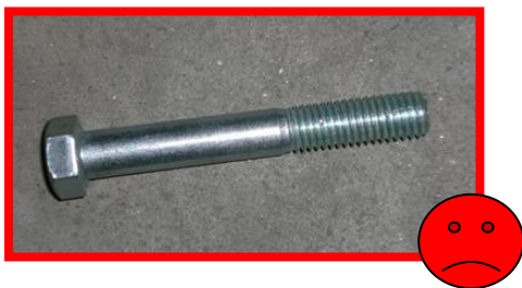
Figure 7. Example BAD (boring) image in the TE Simple Machines unit.

Engineering is Fun — Look for images that show how engineering is a fun, rewarding career. Choose images that reflect the wonder of engineering over those that depict engineering as a boring, too-hard-to-achieve field.