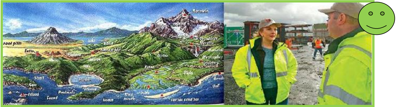
Figure 9. Example alternative image style for the Engineering for the Earth unit illustrating the science behind landforms and the engineering application of knowledge of landforms.