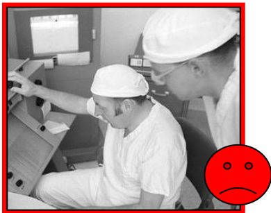
Figure 1. Example BAD image.

Dispel the Engineering is for Nerds Stereotype — To do this, limit your use of images that depict (Caucasian) males as engineers doing things alone or sitting at computer terminals. And, leave out of your documents entirely any images that imply engineering is for nerds. Both of these ideas—only (white) males can be engineers and engineering is for nerds—are already hurdles that the engineering community must overcome. See Figures 1 and 2 for examples of what to use and what not to use. Images of (Caucasian) males doing engineering can be used of course—just not time and time again. Figure 2 is a well-messaged depiction of engineering, showing that engineers are diverse and enjoy their careers—a better image choice.