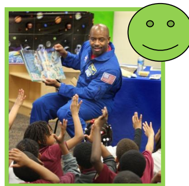
Figure 2. Example GOOD image of an engineer (and working with kids!).