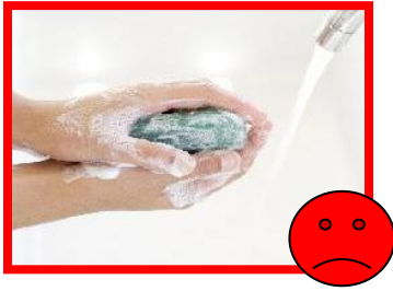
Figure 3. Example BAD (boring) image in the Cells unit.