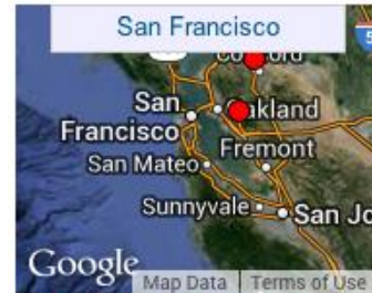
Geology and design in earthquake prone areas

Video website: https://youtu.be/7hoSqazNmfY