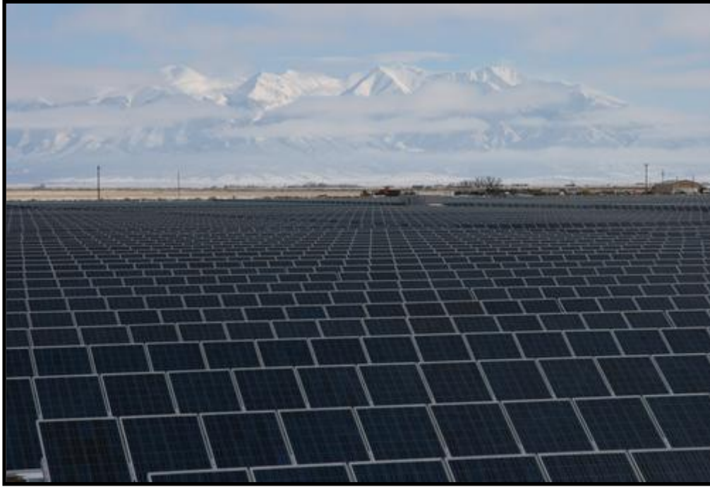
This field of PV panels in Alamosa, CO, is one of the largest PV power plants in the US.

In this experiment, you will measure voltage and current in order to determine the power output of a photovoltaic (PV) panel. You will vary the resistance in a simple circuit connected to the panel to demonstrate the effects on voltage, current, and power output. Then, you will calculate power for each resistance setting, creating a graph of current vs. voltage, and identifying the maximum power point.