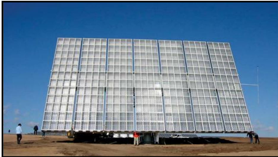
Figure 1. An example concentrated photovoltaic (CPV) solar system that uses lenses to concentrate the sun onto solar cells behind it.

This article examines how the total solar irradiance hitting a photovoltaic (PV) panel can be increased through the use of a concentrating device, such as a reflector or lens. When you design and build your own solar reflector with cardboard and aluminum foil, you will test your reflector design to determine the optimum angle for increasing the power output of a small PV panel.