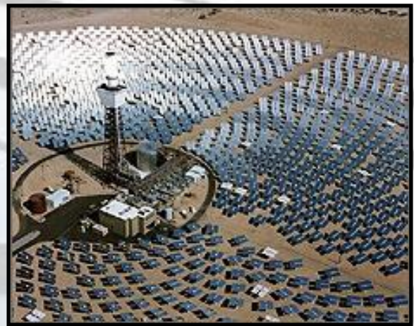
Figure 3. Example solar tower power plant that uses mirrors to concentrate solar power, in Daggett, CA.

Concentrated solar energy is becoming increasingly common for solar power plants. It is used to maximize the efficiency and minimize cost when using highly-efficient (and expensive) solar PV cells, yet it is also used in other types of solar power plants besides PV. Figure 3 shows a solar tower surrounded by thousands of heliostats (mirrors that track the sun). In this solar power plant, a liquid is sent through the top of the tower, heated by the concentrated sun rays, and used to boil water to run a steam-powered turbine.