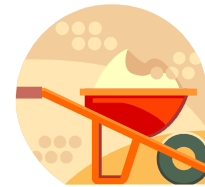
wheel and axle