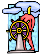
wheel and axle