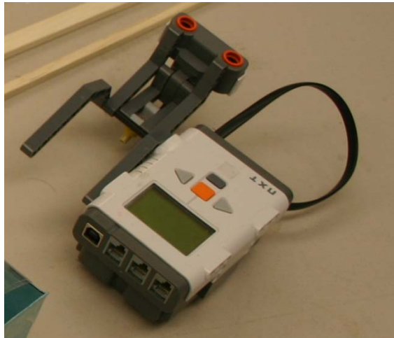
Figure 1: Alternate NXT sensor setup, with brick and attached ultrasonic sensor.