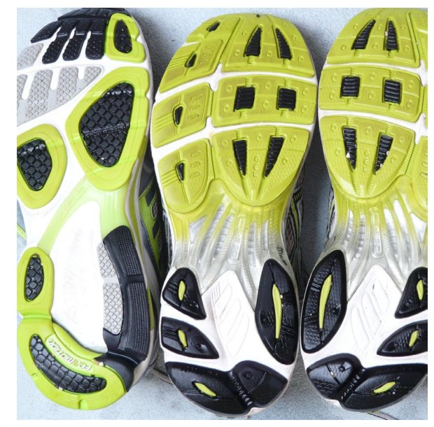
Shoe tread patterns