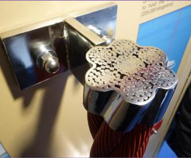
Figure 1: Cross-section of a steel suspender rope from the Golden Gate Bridge (photograph)