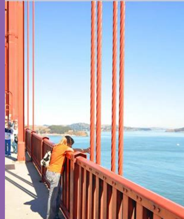
Figure 3: Steel suspender rope on the Golden Gate Bridge (photograph)