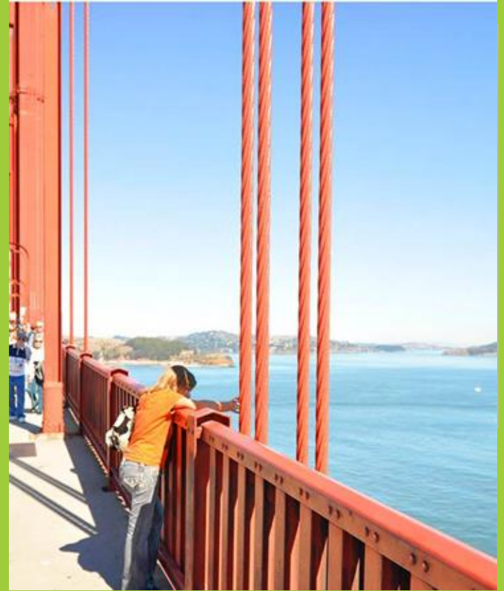
Figure 3: Steel suspender rope on the Golden Gate Bridge (photograph)

What can we infer or predict about what we see?