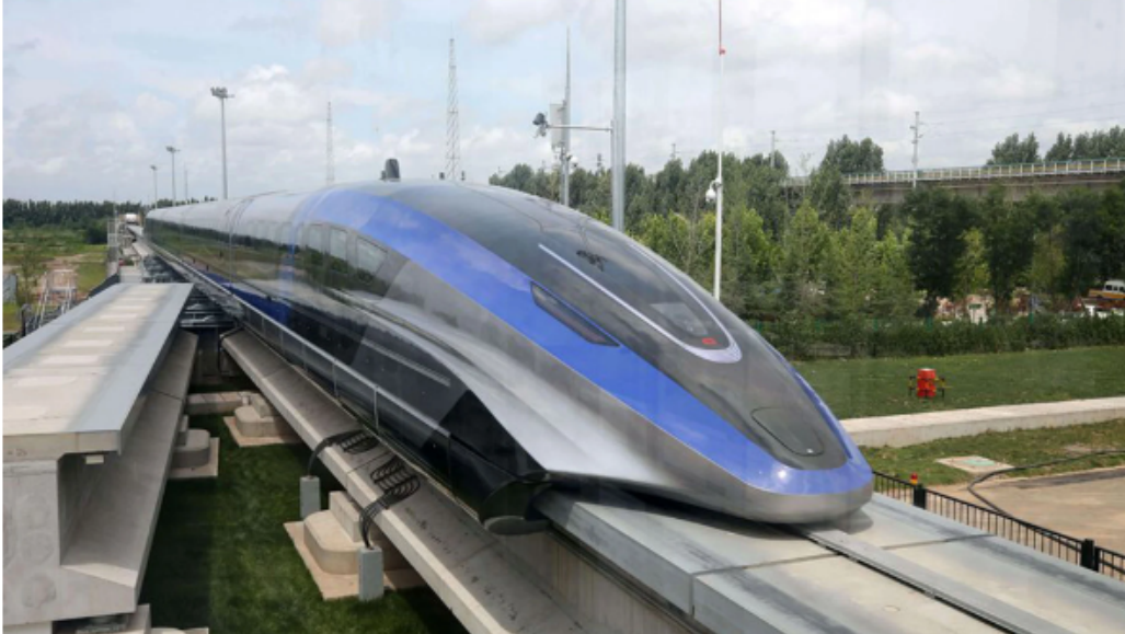
Figure 1: Maglev train diagram

Phenomenon: “Maglev” (magnetic levitation) trains use magnets to move. Magnets are placed on the bottom of the train and on the track. The magnetic fields allow the train to move without friction.