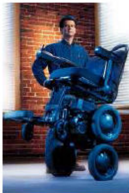
Dean Kamen and the iBOT

The job of a rehabilitation engineer is to improve the quality of life of people with disabilities. For example, rehabilitation engineers have designed the iBOT™ Mobility System, a sophisticated wheelchair that can tackle stairs, rough terrain, and even lift the patient to be eye-level with standing adults. The iBOT was created by Worcester Polytechnic Institute alum Dean Kamen, who also invented the Segway scooter.